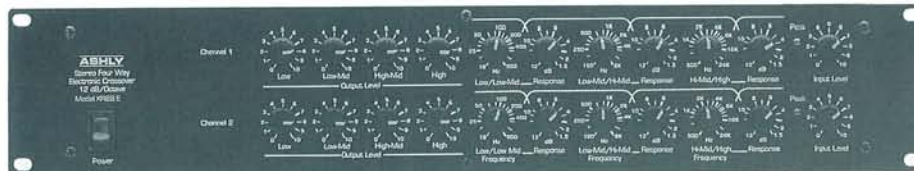
XR-88 Stereo 4-Way

The Ashly Audio series of 12dB Electronic Crossovers is designed to fill the needs of modern high-power sound systems. Crossover points and response are continuously adjustable and individual output stages with wide range gain controls will drive long cable runs and accurately match any power amplifiers.