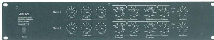
XR-77E Stereo 3-Way